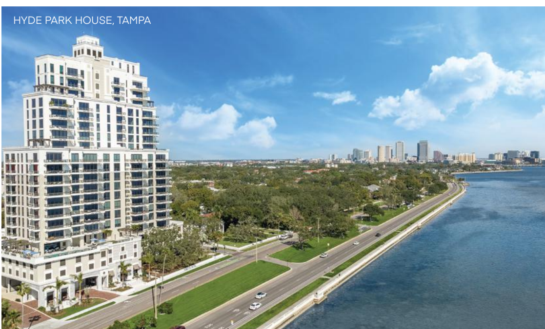
HYDE PARK HOUSE, TAMPA