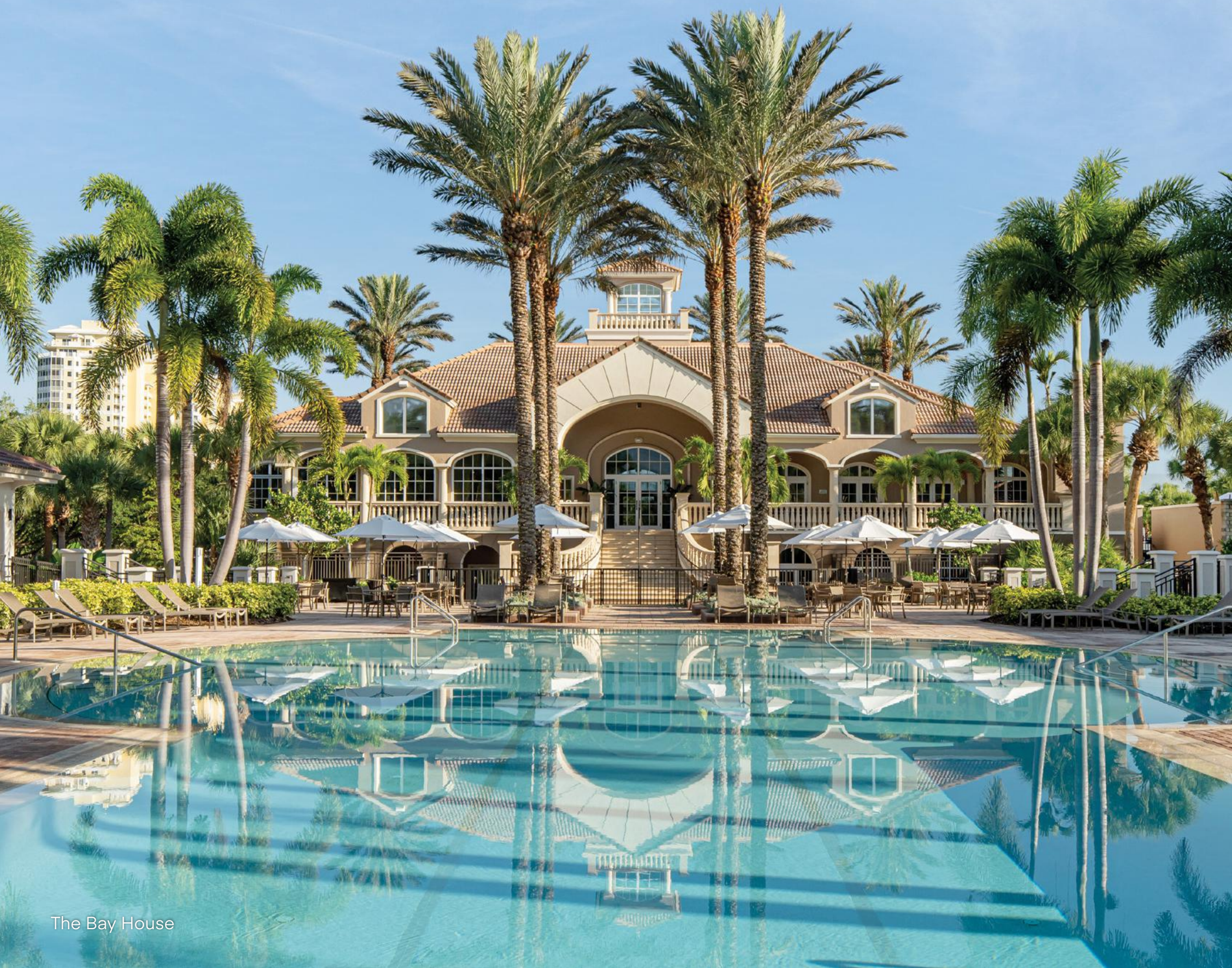
The Bay House

Once you live at The Island, you'll never want to go anywhere else. Everything you want is a short walk, bike ride, or golf cart ride away. That includes many fun and entertaining venues devoted to enhancing residents' lifestyles.