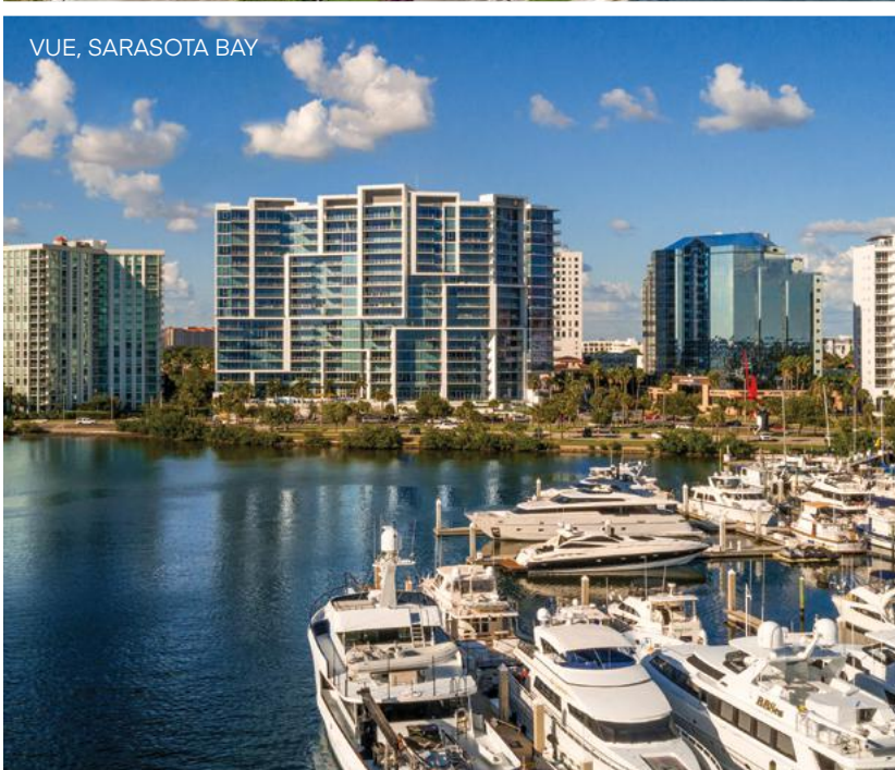
VUE, SARASOTA BAY