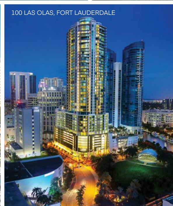
100 LAS OLAS, FORT LAUDERDALE