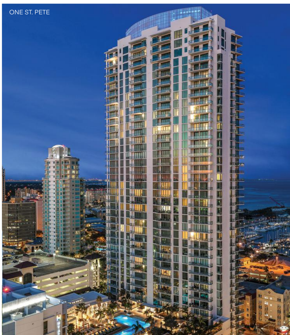
ONE ST. PETE